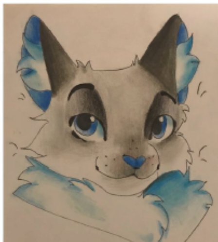
Artwork supplied by Jazmine, age 14