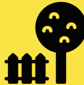
In The Yard